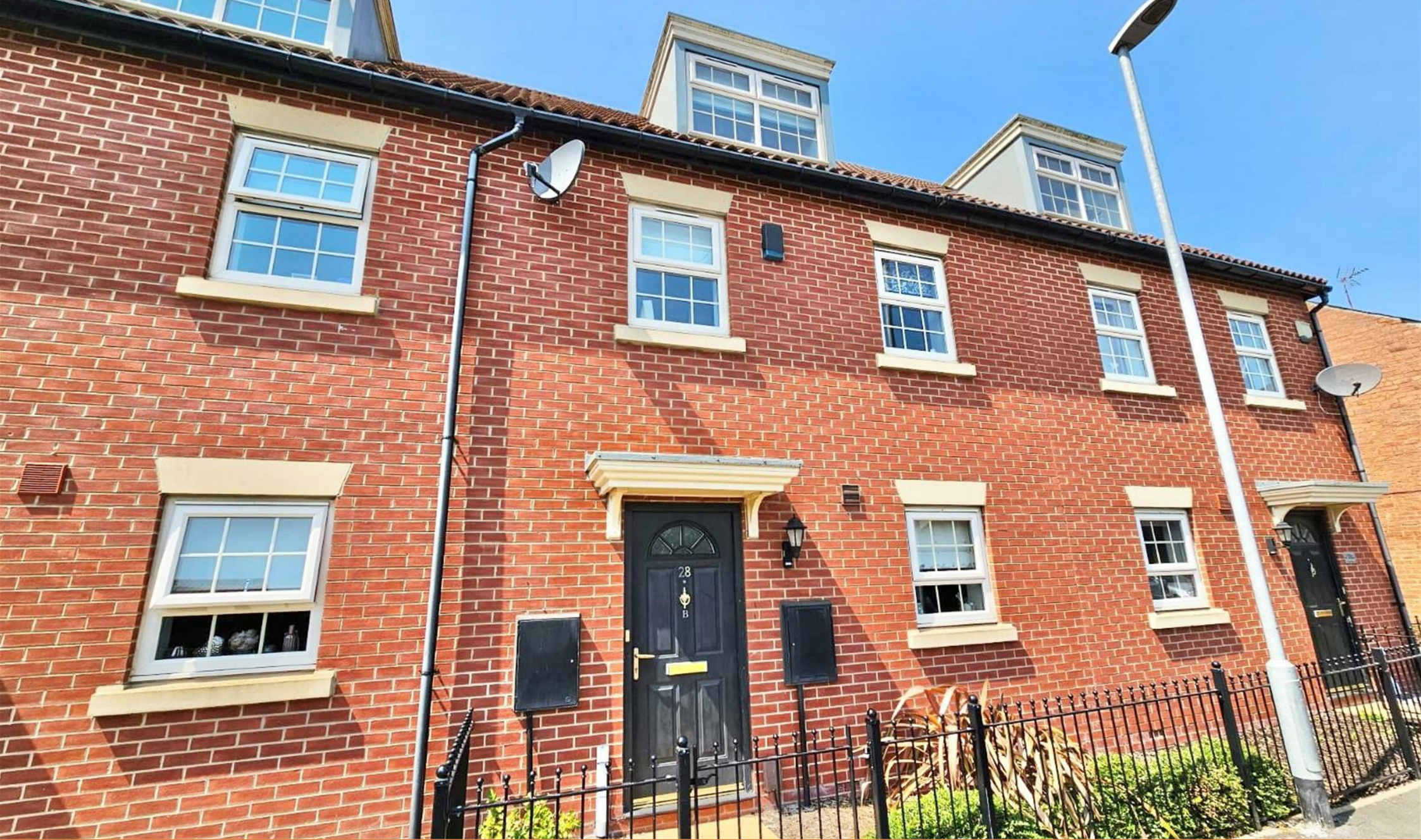
The Twitchell, Sutton-In-Ashfield, NG17 5DA